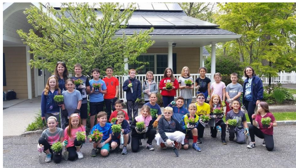
FOREST BROOK SCHOOL HELD A BEAUTIFICATION DAY AT OUR SMITHTOWN HOUSE