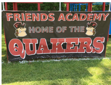
CHILDREN'S FOUNDATION OF SUFFOLK DONATION

ITALIAN WELFARE LEAGUE ASSISTED SOME OF OUR MEDICALLY FRAIL CHILDREN