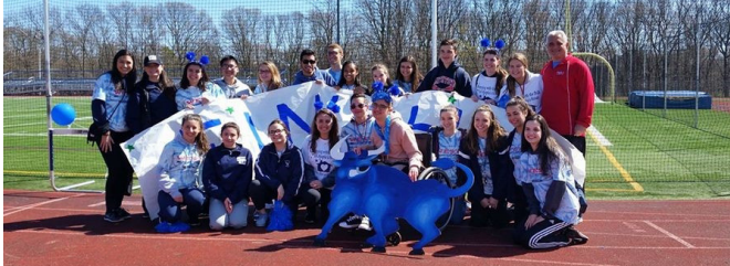
SMITHTOWN WEST HOSTED A FUNDRAISER