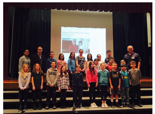
SAWMILL SCHOOL IN COMMACK HOSTED A FUNDRAISER